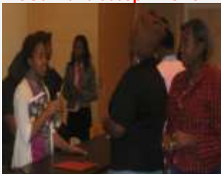
Conference attendees interact with panelists